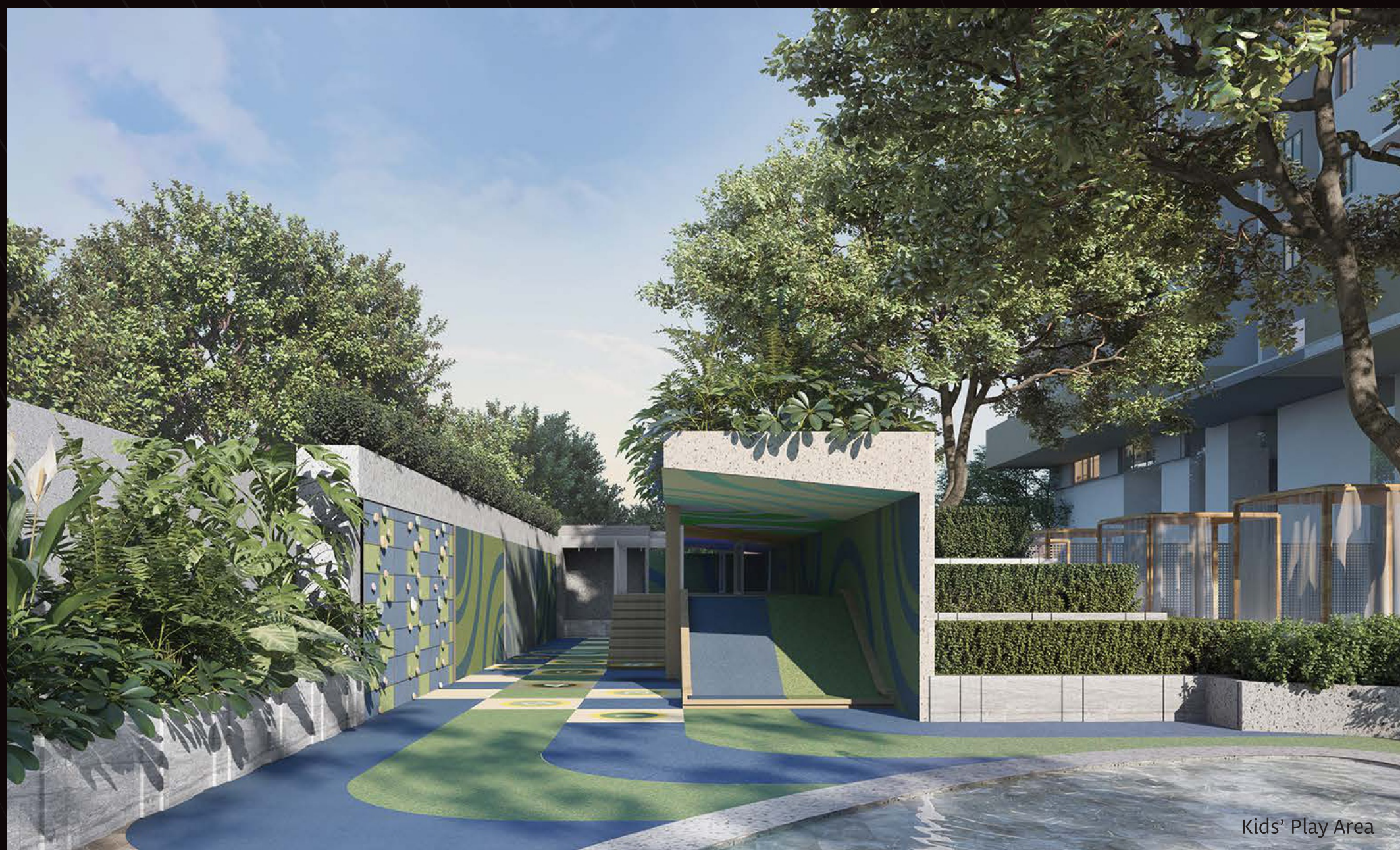
Kids' Play Area

A space where innocent giggles & laughter of your child is nurtured!